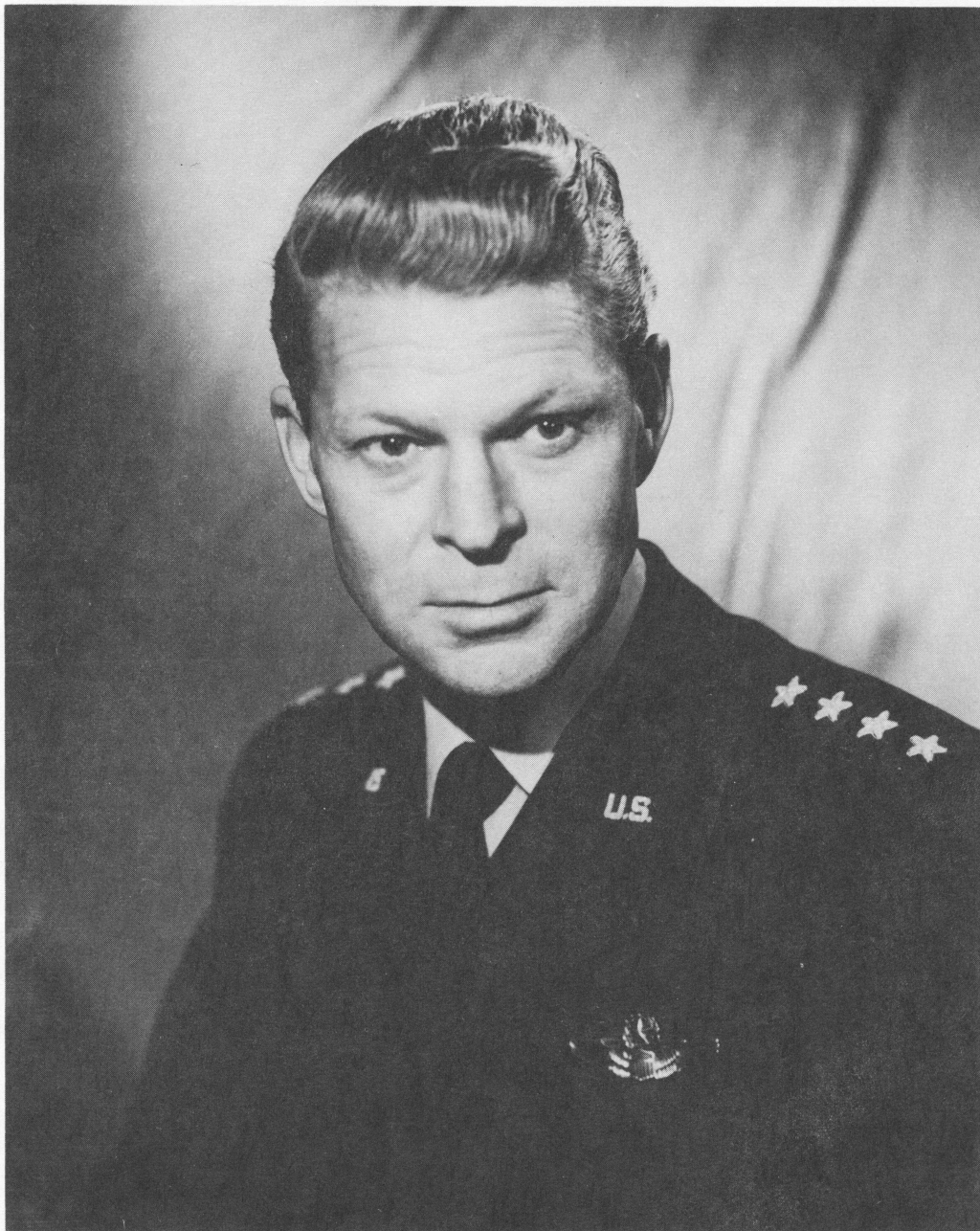
GENERAL LAURIS NORSTAD